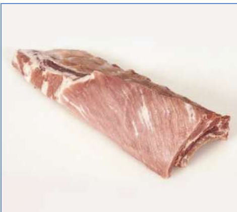
4 Gloucester Rib Rack.