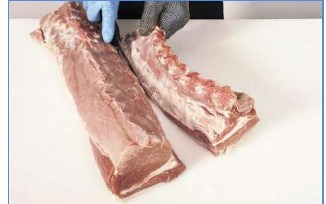
3 Make a straight cut to separate the eye muscle from the rib section.