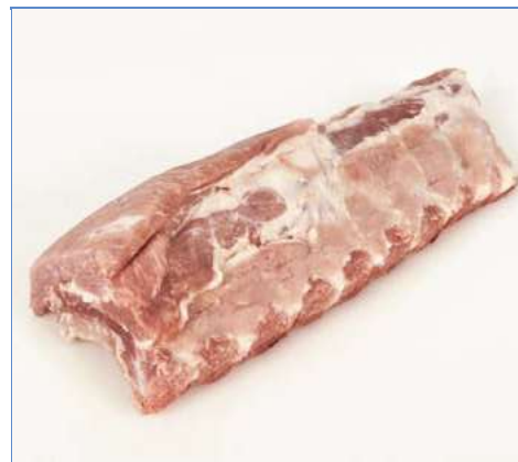
5 Gloucester Rib Rack.