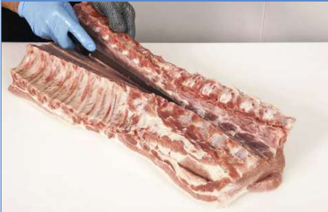
1 After removing the London ribs (vertebrae) section.