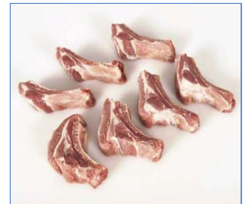
7 Gloucester Ribs – individual.