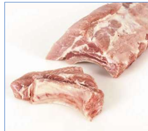
6 Cut between the ribs to create Gloucester Ribs – individual.