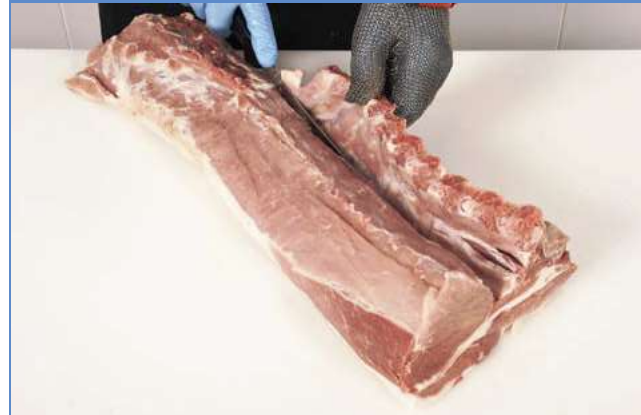
2 Remove the rib section starting at the top of the eye muscle. Follow the seam of the eye muscle leaving all remaining muscles and loin tail on the rib section.